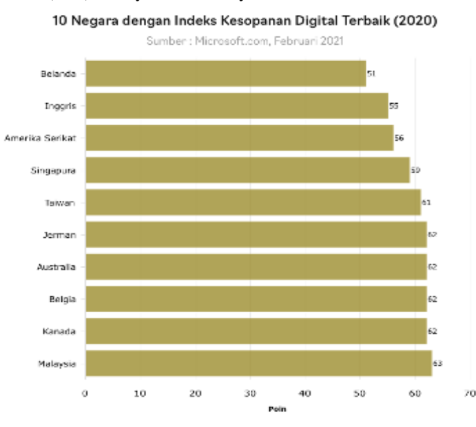
Figure 2. Table of Countries with the Best Digital Politeness Index (2020)

In February, Microsoft conducted a Digital Civility Index (DCI) survey to measure the level of global digital politeness in several countries. The following are the ten countries with the best level of politeness on social media according to the results of the Digital Civility Index (DCI) survey conducted by Microsoft: